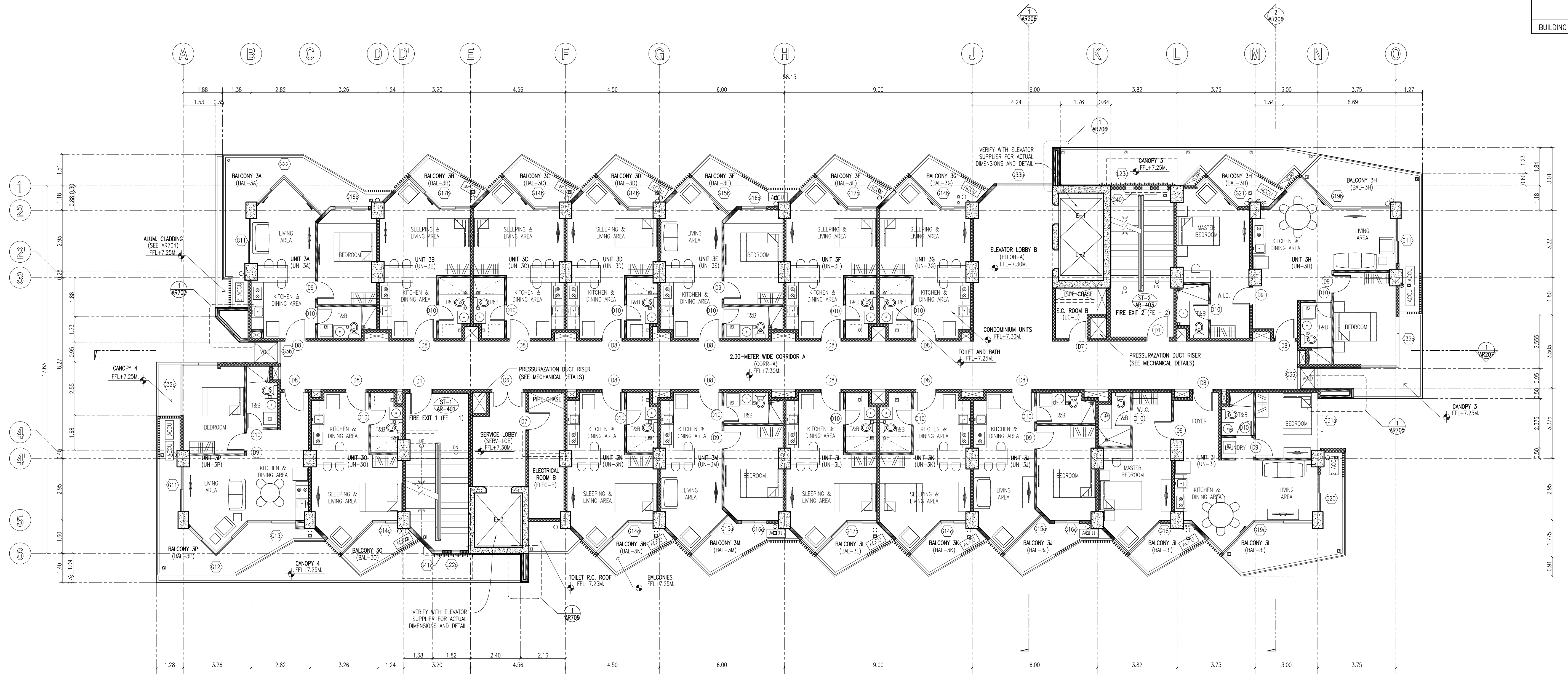
TAMBULI - RESIDENTIAL TOWER D THIRD LEVEL PLAN SCALE 1 : 100 METERS

ARKinamix MEDALLAJ ARCHITECTS TEL. (63-32) 253-9395 787 HAPPY VALLEY ROAD, CEBU CITY TELEFAX (63-32) 255-4253