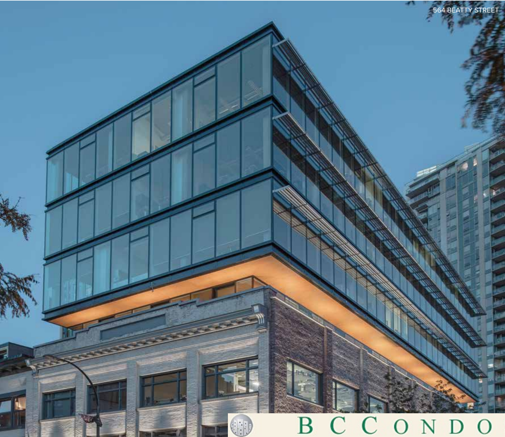
564 BEATTY STREET