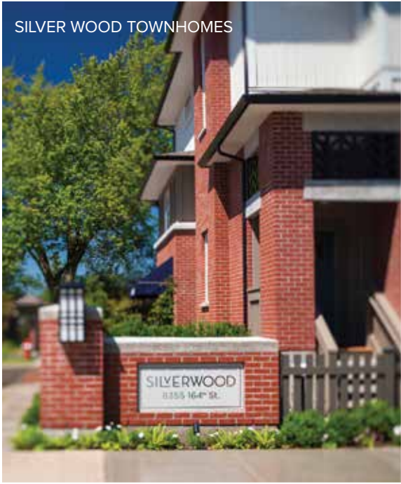
SILVER WOOD TOWNHOMES