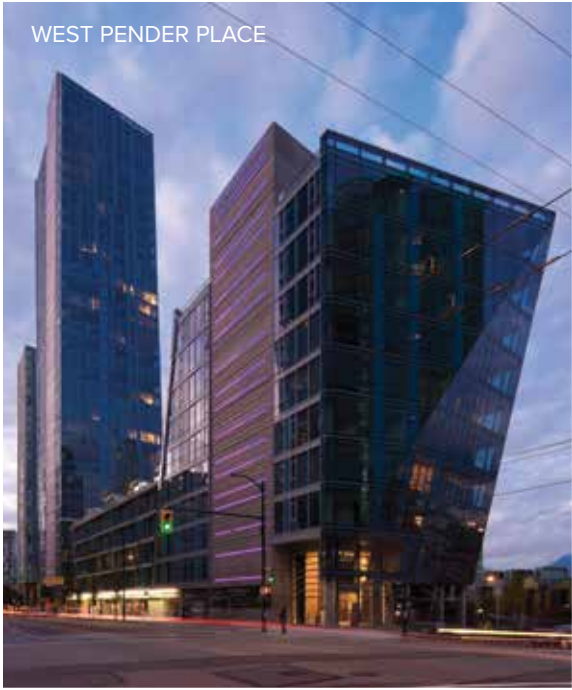
WEST PENDER PLACE