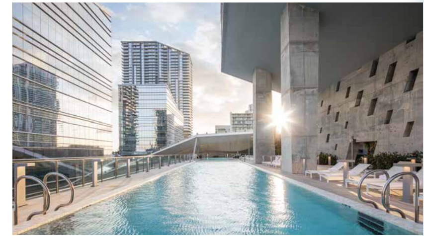
Pool at Reach