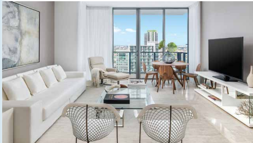
Living Room at Reach

PRIVATE RESIDENCES AVAILABLE FOR IMMEDIATE OCCUPANCY.