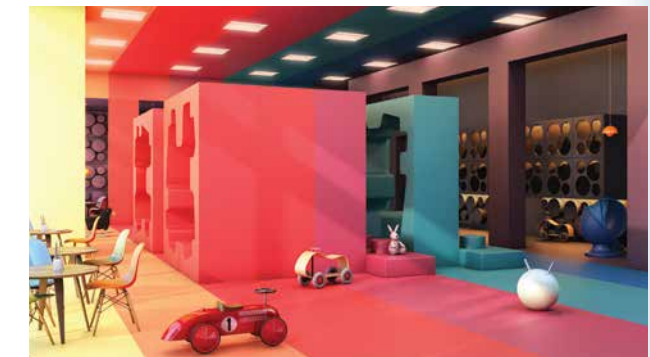
Left: Tea Lounge at Reach Right: Children's playroom

A haven for the culturally curious, the urban adventurers, and the fashion faithful, Brickell City Centre boasts 500,000 square feet of retail and restaurant space right on your doorstep. This is an address to be envied, the destination for the discerning buyer.