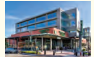
The Brewery District, New Westminster

Projects include The Brewery District, New Westminster; River District, Vancouver; Fraser Health Shared Services Facility, Langley; and Pharmasave National Head Office, Langley, to name a few.