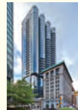
Jameson House, Vancouver

Projects include Jameson House; Paramount Place; Highgate Village; Miramar Village and Westwood Village, to name a few.