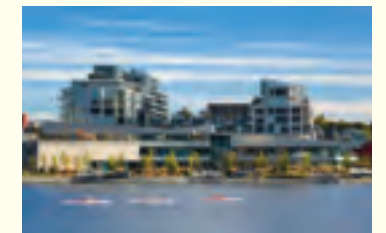
Creekside Community Centre, The Village at False Creek

Vancouver projects include Jameson House; CBC TV Towers; Creekside Community Recreation Centre; Trout Lake Ice Rink; Rennie Art Gallery and False Creek Energy Centre, to name a few.