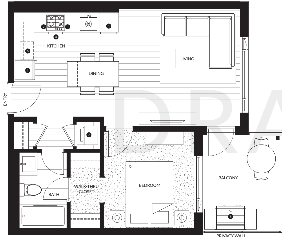
HOMES #06 & #08 FLOOR PLANS WILL BE THE MIRRORED LAYOUT