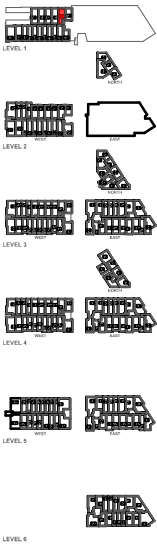
TH-1.1 - GF