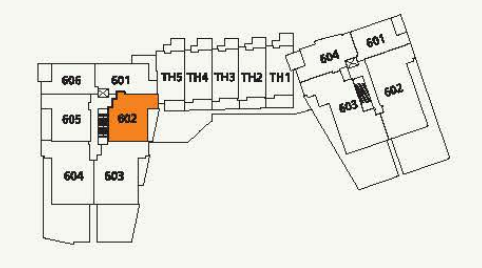
AT FOREST'S-EDGE THREE/FOUR 6TH FLOOR