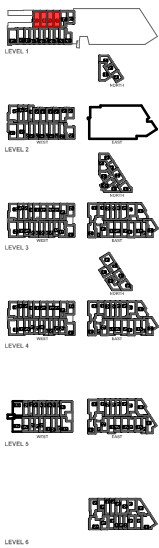
TH-1 - GF