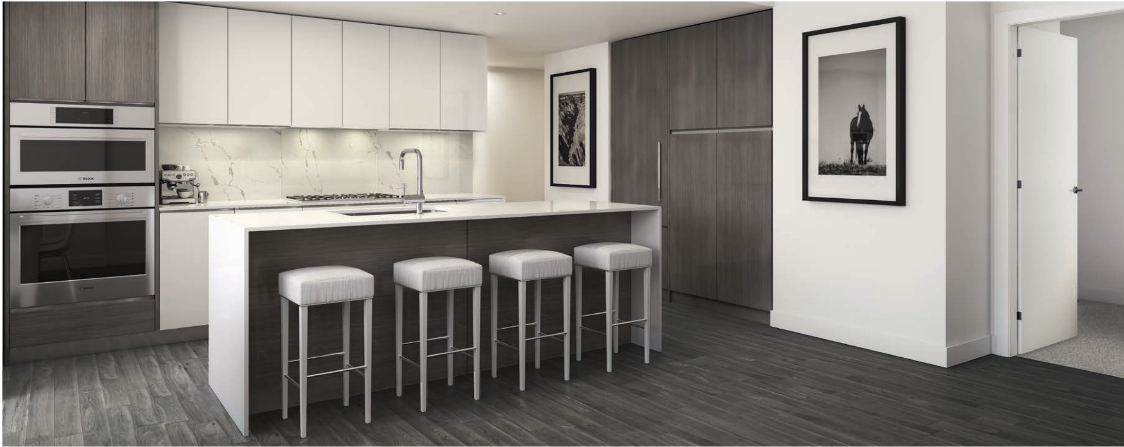
Umbra (dark) Scheme

The kitchens in Phase 3 are thoughtfully planned and beautifully detailed. Imported Italian Armony Cucine cabinetry, Bosch German appliances and polished quartz counters combine to create an atmosphere of contemporary elegance.