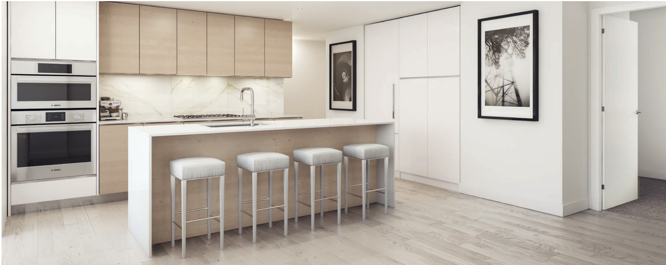
Lux (light) Scheme

The interiors of SOLO District Phase 3 are carefully crafted by Cristina Oberti Interior Design, a Vancouver-based studio noted for refined residential design. The collection continues the exceptional standard established by the earlier phases of the community, and complements the elevated design of the architecture and building amenities.