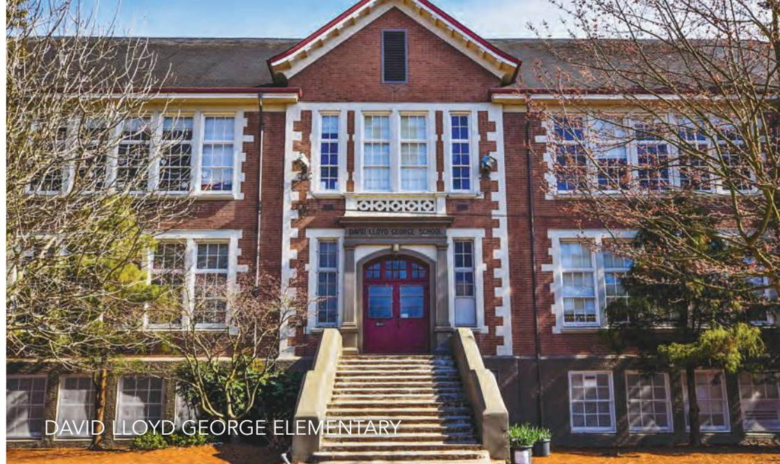
DAVID LLOYD GEORGE ELEMENTARY