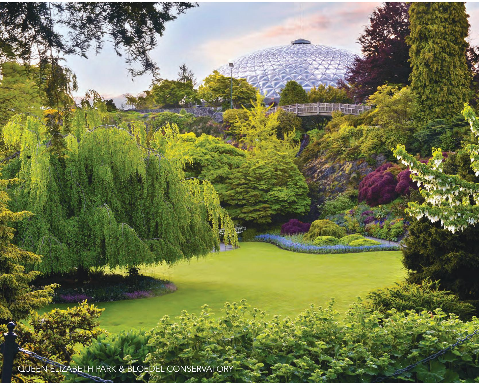
QUEEN ELIZABETH PARK & BLOEDEL CONSERVATORY