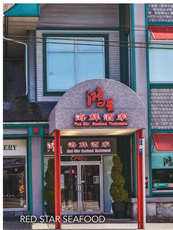
RED STAR SEAFOOD

Marpole, Oakridge & Kerrisdale Community Centres are all within a short driving distance and offer a variety of programs for adults and children. Take an afternoon stroll along Granville Street and experience a diverse selection of ethnic cuisine or head over to the West Boulevard strip in Kerrisdale and browse your favourite boutique shops. Top ranked schools such as David Lloyd George Elementary, Sir Wilfred Laurier Elementary and Sir Winston Churchill Secondary are all located within the Shannon 18 school catchment.