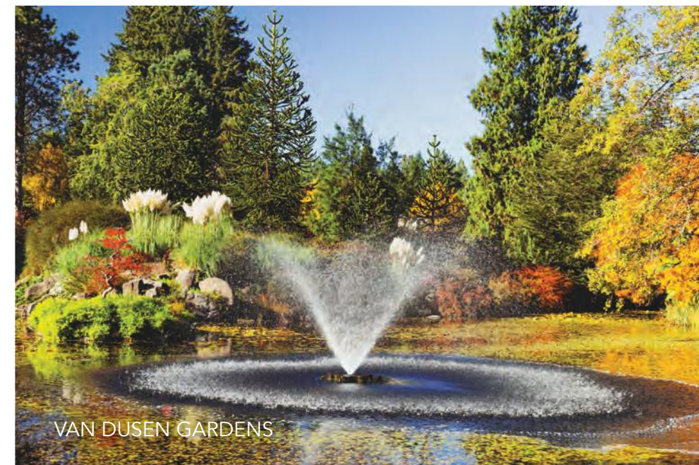
VAN DUSEN GARDENS