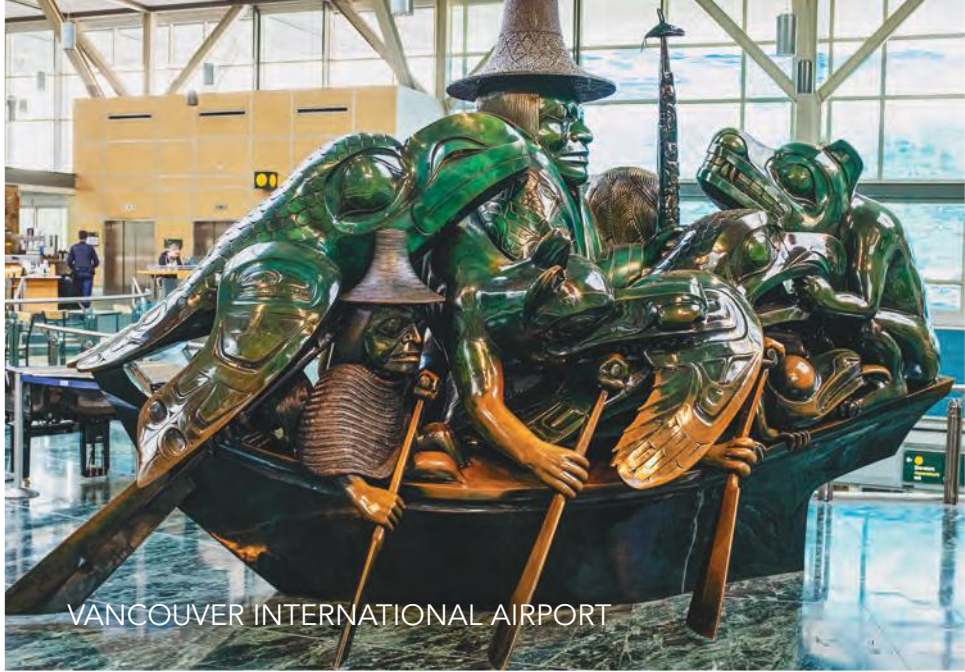
VANCOUVER INTERNATIONAL AIRPORT