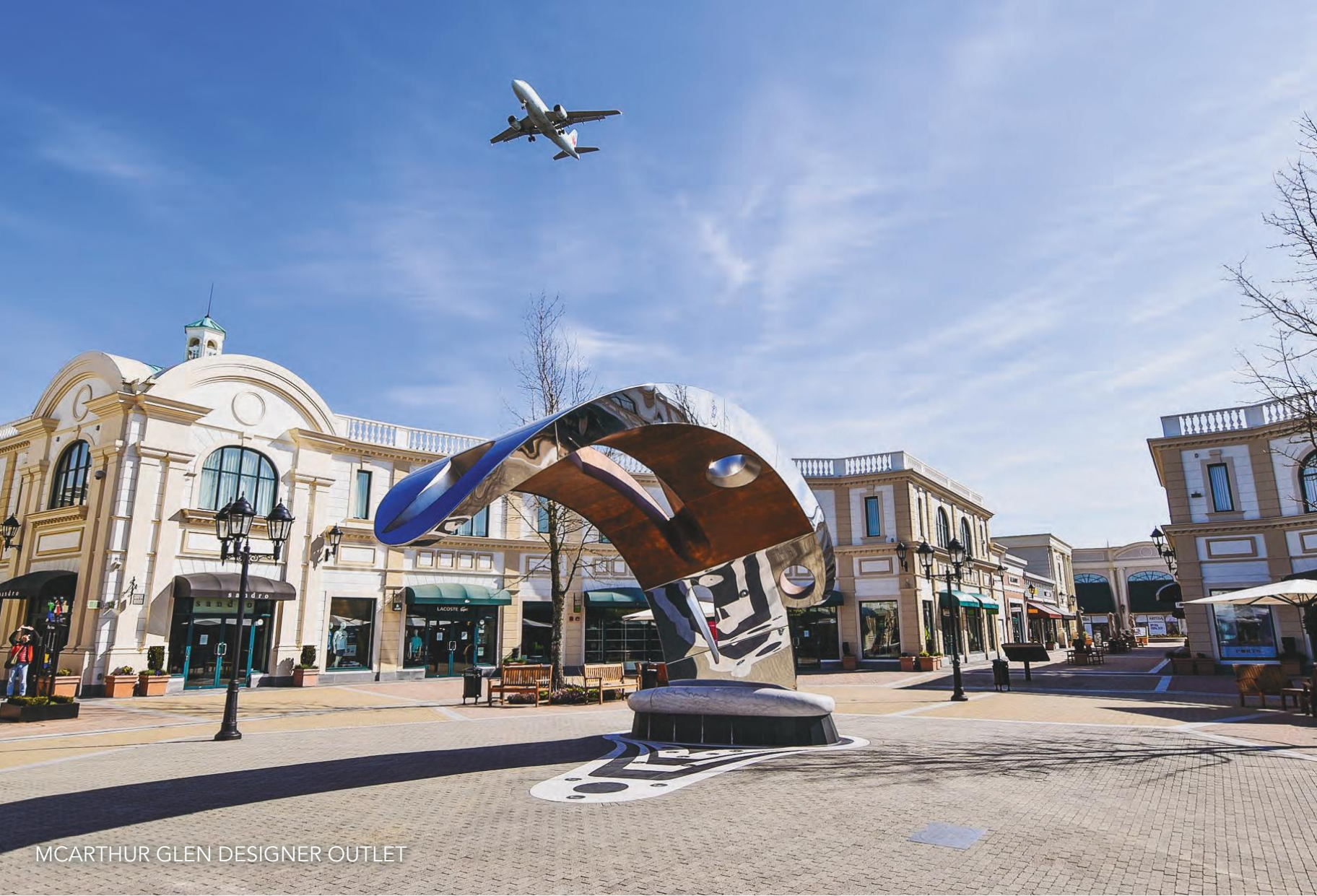
MCARTHUR GLEN DESIGNER OUTLET