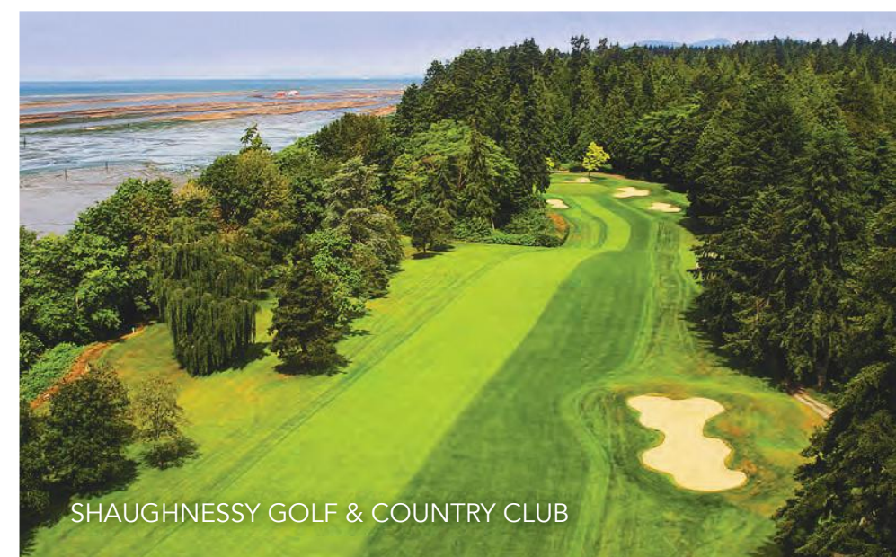
SHAUGHNESSY GOLF & COUNTRY CLUB