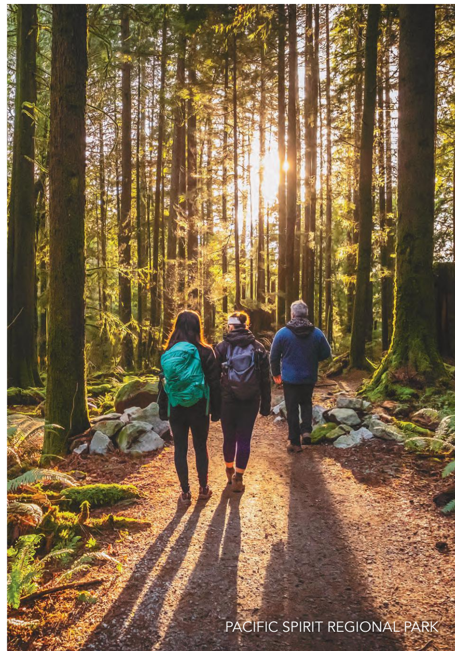
PACIFIC SPIRIT REGIONAL PARK