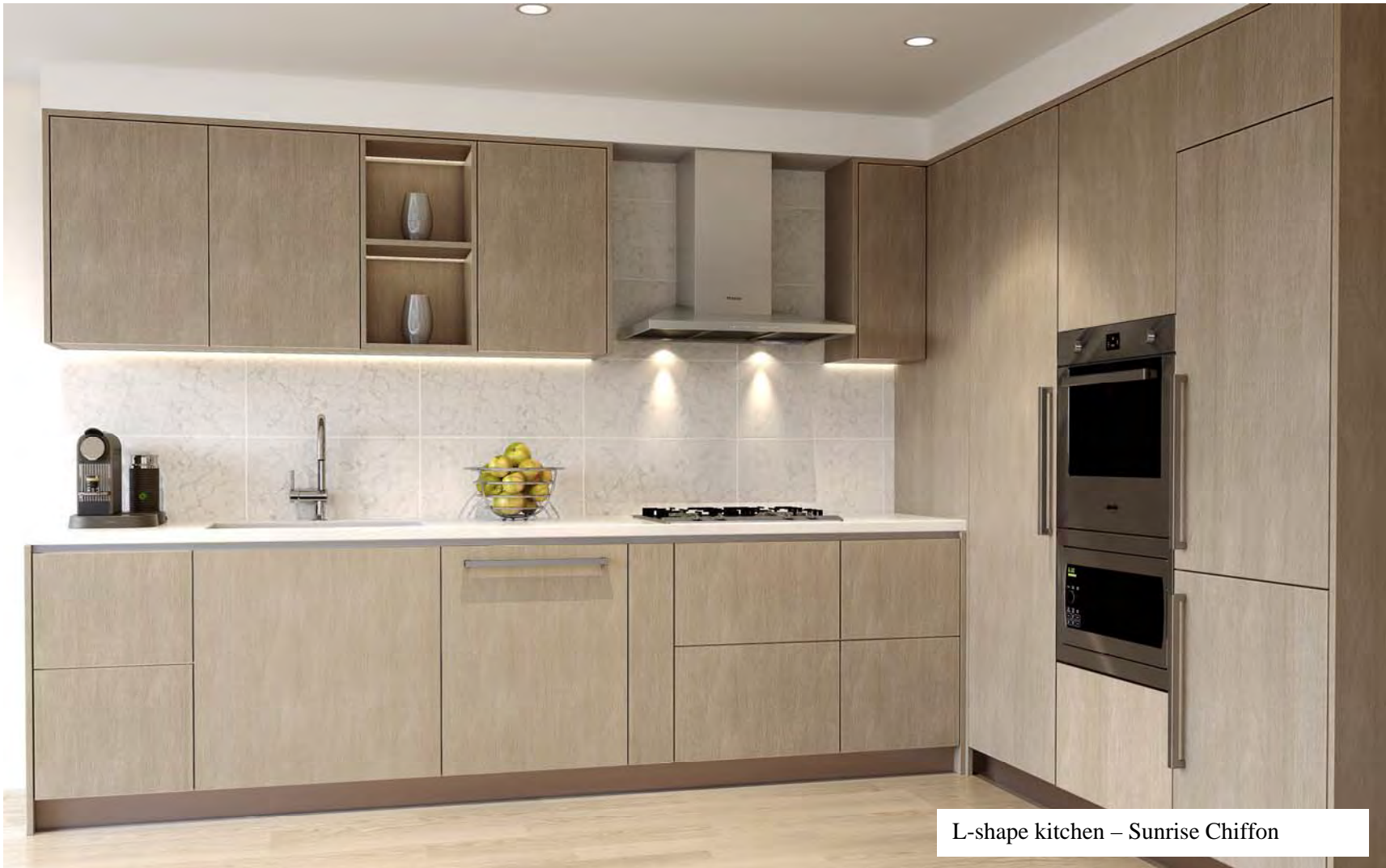
L-shape kitchen – Sunrise Chiffon

Actual suite interiors, exteriors and views may be noticeably different than what is depicted in photographs and renderings. The developer reserves the right to make modifications, substitutions, change brands, sizes, colours, layouts, materials, ceiling heights, features, finishes and other specifications without prior notification. Such details are governed by the applicable offer to purchase and agreement of sale, and disclosure statement. This is not an offering for sale. Any such offering can only be made with the applicable offer to purchase and agreement of sale, and disclosure statement. Concord W1 Limited Partnership. E. & O.E.