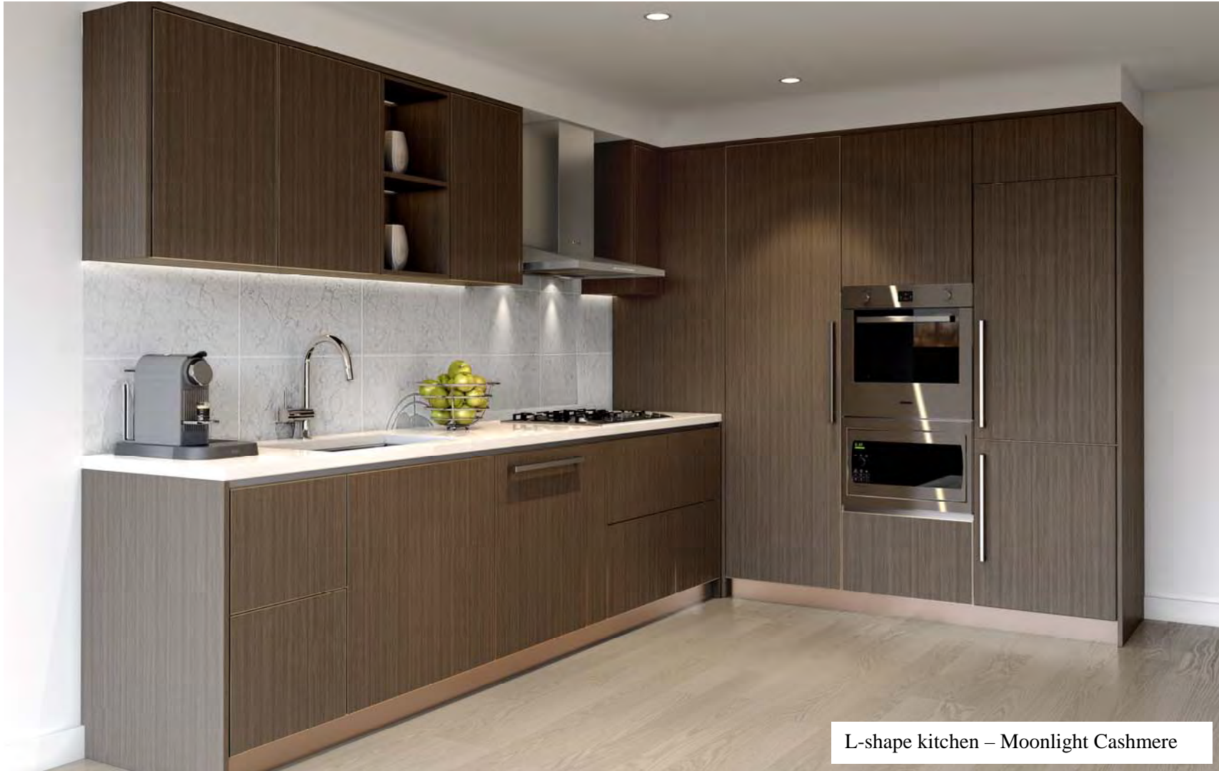
L-shape kitchen – Moonlight Cashmere

Actual suite interiors, exteriors and views may be noticeably different than what is depicted in photographs and renderings. The developer reserves the right to make modifications, substitutions, change brands, sizes, colours, layouts, materials, ceiling heights, features, finishes and other specifications without prior notification. Such details are governed by the applicable offer to purchase and agreement of sale, and disclosure statement. This is not an offering for sale. Any such offering can only be made with the applicable offer to purchase and agreement of sale, and disclosure statement. Concord W1 Limited Partnership. E. & O.E.