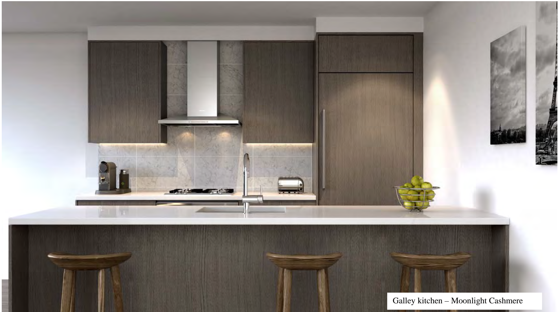
Galley kitchen – Moonlight Cashmere

Actual suite interiors, exteriors and views may be noticeably different than what is depicted in photographs and renderings. The developer reserves the right to make modifications, substitutions, change brands, sizes, colours, layouts, materials, ceiling heights, features, finishes and other specifications without prior notification. Such details are governed by the applicable offer to purchase and agreement of sale, and disclosure statement. This is not an offering for sale. Any such offering can only be made with the applicable offer to purchase and agreement of sale, and disclosure statement. Concord W1 Limited Partnership. E. & O.E.