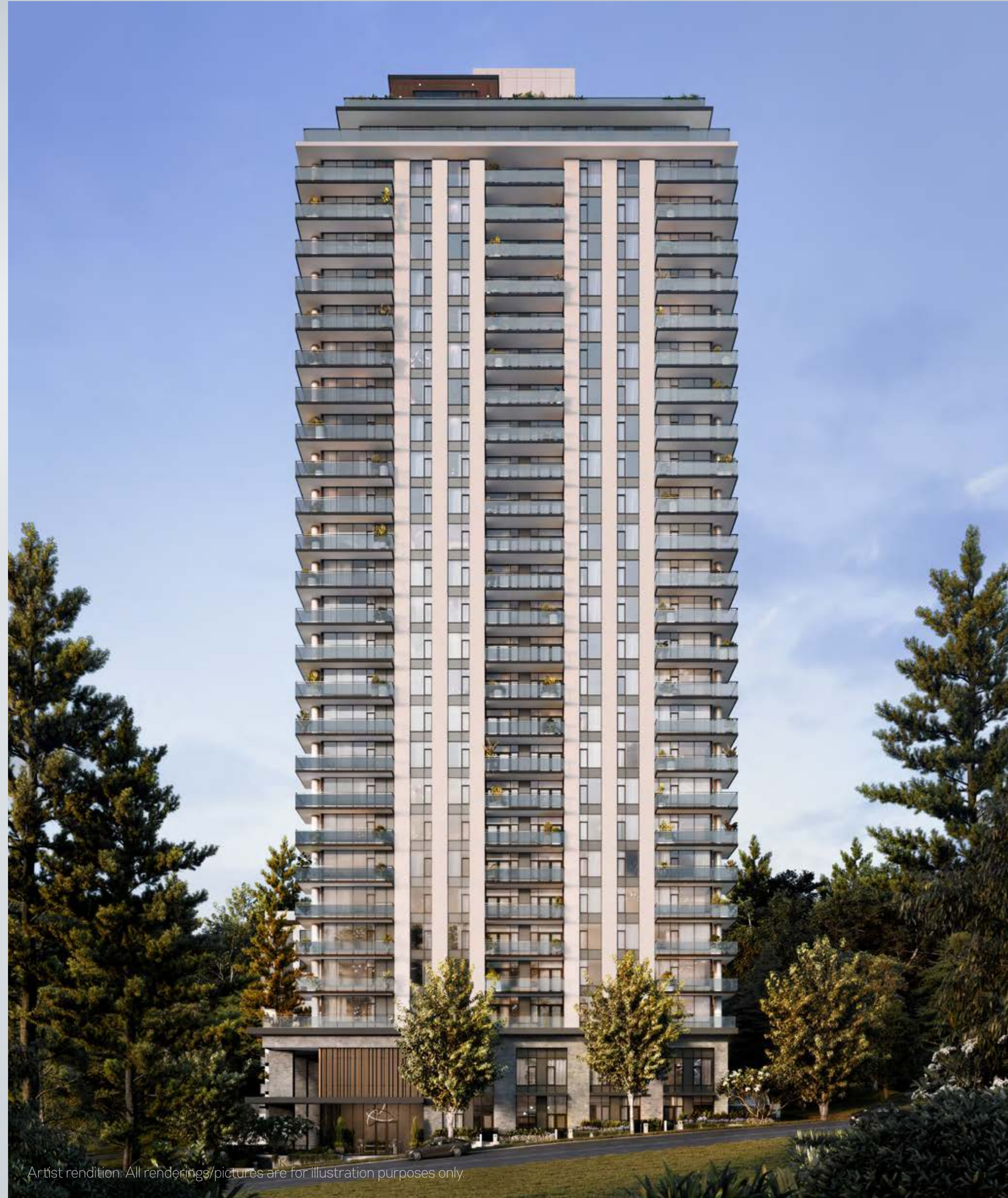
Artist rendition. All renderings/pictures are for illustration purposes only.