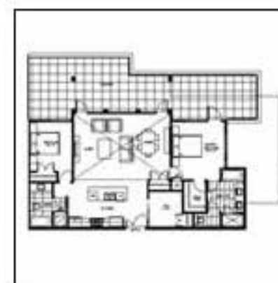
Penthouse - 2 Bedroom + Den