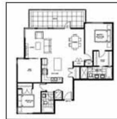
2 Bedroom + Den