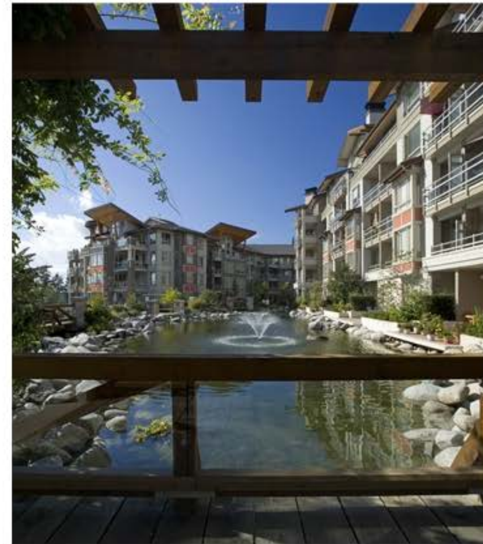
Takaya Developments award winning Season Project completed in 2006.

TAKaya has carefully selected a team of leading B.C. professionals, including *Howard Bingham Hill Architects (Georgie Award winner) *Durante Kreuk Ltd., Landscape Architects (Silver Georgie Award winner) *Insight Design Group, Interior Designers * Jones Kwong Kishi Consulting Ltd., Structural Engineers * Horizon Engineering Inc., Geotechnical Engineers * GHL Consultants Ltd., Building Code Consultants, * Morrison Hershfield, Building Envelope Consultants.