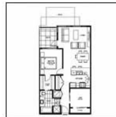
1 Bedroom + Den A

Click on image to download PDF of floorplans.