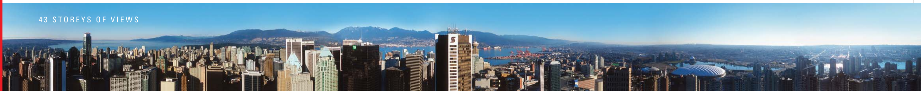
43 STOREYS OF VIEWS

Dimensions, sizes, specifications, layouts and materials are approximate only and subject to change without notice. E.&O.E.