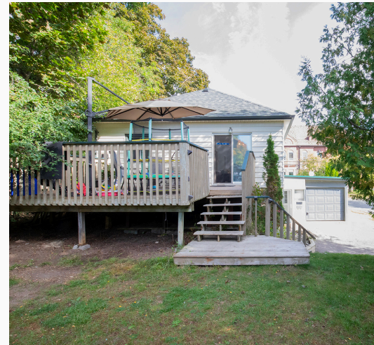
Large Yard with Deck