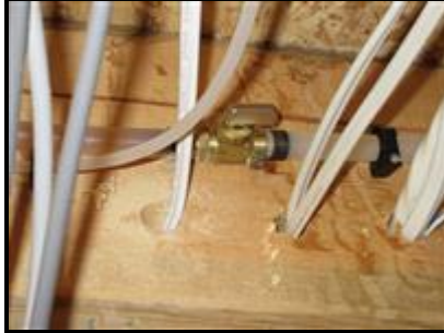
7.12 Picture 1

(1) The outside taps should be shut off and drained before winter.