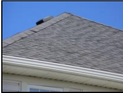
1.0 Picture 1

The entire roof surface is asphalt shingles. The shingles appear to be in good overall condition. They are installed well with all of the necessary caps and flashings.