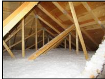
4.0 Picture 2