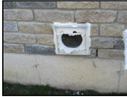
4.5 Picture 2

The insulation and ventilation of the home was inspected and reported on with the above information. While the inspector makes every effort to find all areas of concern, some areas can go unnoticed. Venting of exhaust fans or clothes dryer cannot be fully inspected and bends or obstructions can occur without being accessible or visible (behind wall and ceiling coverings). Only insulation that is visible was inspected. Please be aware that the inspector has your best interest in mind. Any repair items mentioned in this report should be considered before purchase. It is recommended that qualified contractors be used in your further inspection or repair issues as it relates to the comments in this inspection report.