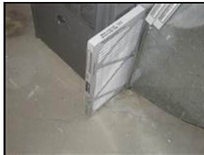
6.0 Picture 1

(2) The furnace filter should be changed on a regular basis.