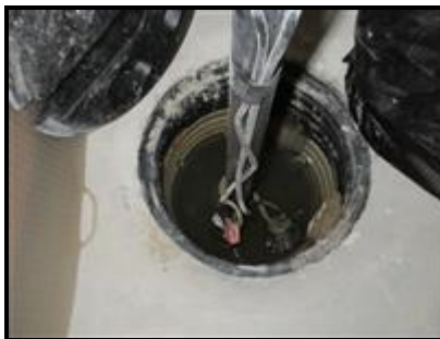
7.13 Picture 1

The sump pump should be tested on a regular basis to ensure its proper operation.