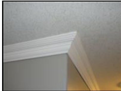
8.1 Picture 1

I understand from the present owner that there has been some slight truss uplift in the master bedroom. This is quite common where the ceiling lifts slightly one season and drops back down in the opposite season. This is quite common and not a structural concern. The present owner has installed some crown moulding and only nailed it to the ceiling. This can then slide up and down very slightly to cover the cracked drywall tape.