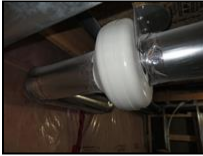
4.5 Picture 1