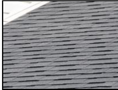
1.0 Picture 2