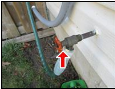
7.12 Picture 3

(2) The outside tap at the left side was leaking at the handle. A new seal / gasket will be needed.