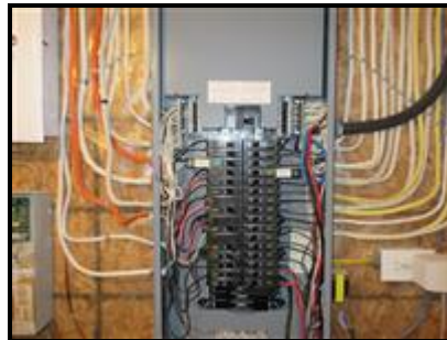
5.2 Picture 1

The main electrical panel was inspected and found to be installed properly and wired correctly. All of the proper sized breakers were present.