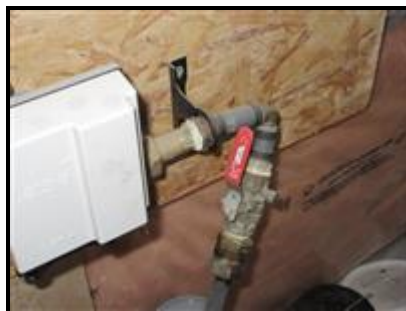
7.4 Picture 1