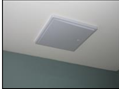
7.12 Picture 2

(2) The outside tap at the left side was leaking at the handle. A new seal / gasket will be needed.