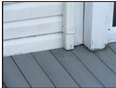
1.3 Picture 1

The downspout at the back of the house by the back door is draining right against the deck. I would recommend adding an extension here to drain well away from the house.