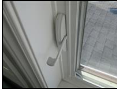
8.7 Picture 1

(2) There appears to have been some slight past seepage above a back basement window. I understand that the caulking outside had failed. The present owner has since recaulked. This should be monitored and kept well caulked.