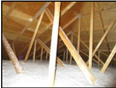
4.0 Picture 1

The attic contains blown in fiberglass insulation. This insulation appears to be well placed and installed in adequate amounts.