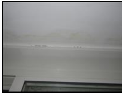
8.7 Picture 2

(2) There appears to have been some slight past seepage above a back basement window. I understand that the caulking outside had failed. The present owner has since recaulked. This should be monitored and kept well caulked.