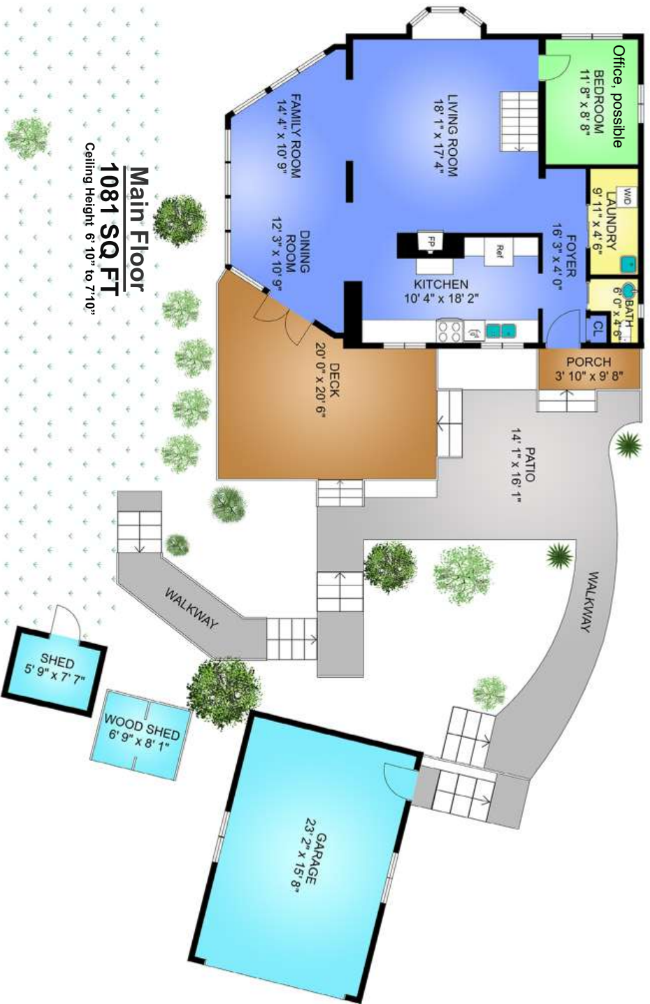
Main Floor 1081 SQ FT Ceiling Height 6'10" to 7'10"