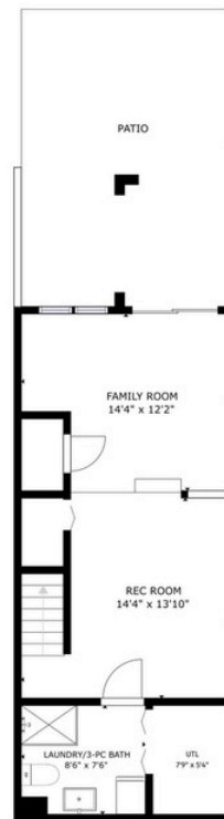
Lower Floor - 495 sq.ft Ceiling Height: 7'75"