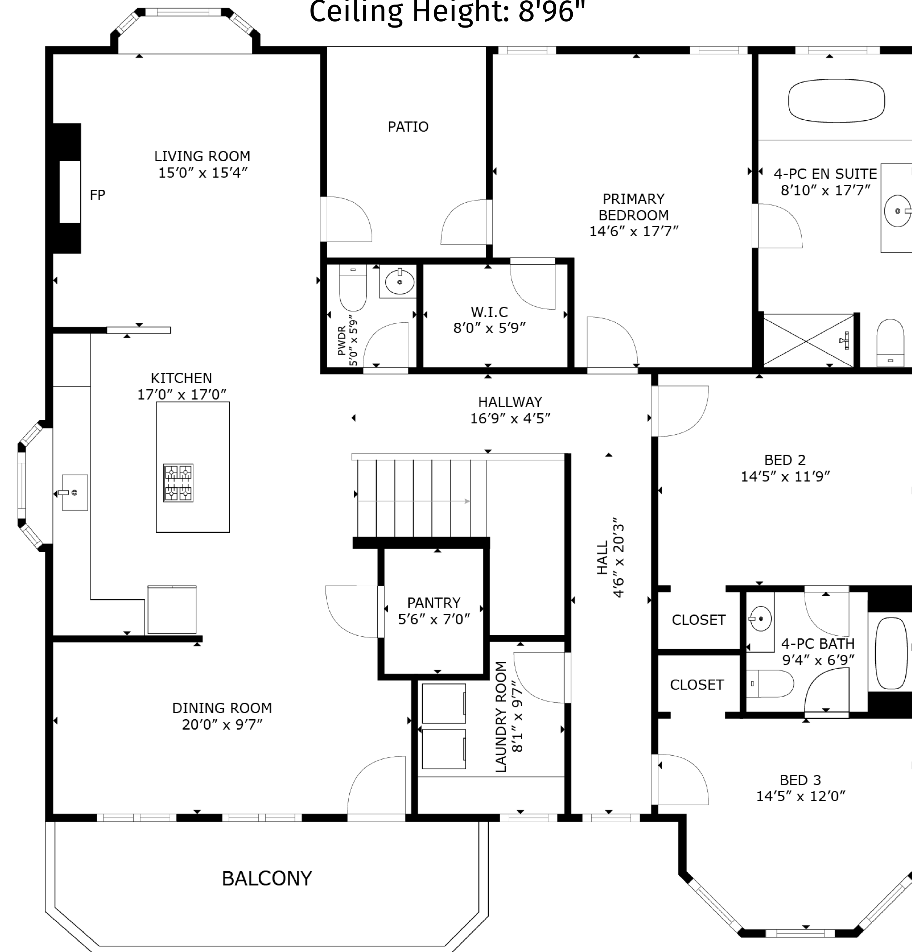
Second Floor - 2,124 sq.ft Ceiling Height: 8'96"