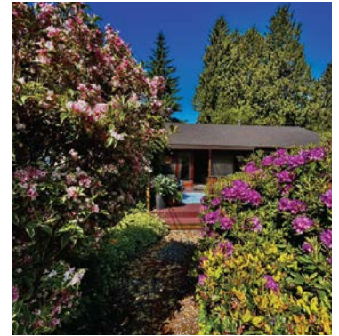
Garden in bloom photos