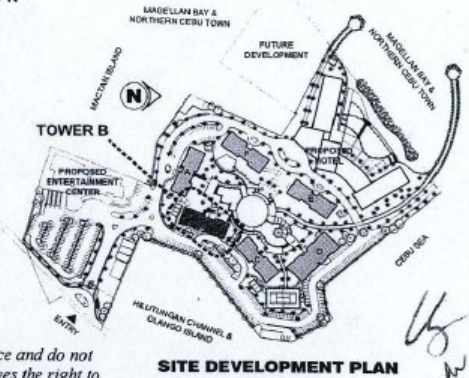
SITE DEVELOPMENT PLAN

While every care has been taken in preparing this material, all plans, details and specifications contained herein are subject to change without prior notice and do not constitute part of any offer or contract. No warranty or representation is made by the Developer as to their accuracy. Furthermore, the Developer reserves the right to alter, deviate or dispense with the plans and specifications referred to herein. Furniture, appliances and equipment indicated herein are for illustrative purpose only.