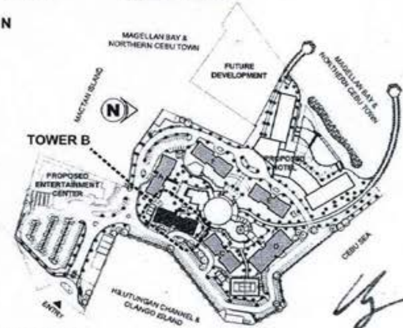
SITE DEVELOPMENT PLAN

While every care has been taken in preparing this material, all plans, details and specifications contained herein are subject to change without prior notice and do not constitute part of any offer or contract. No warranty or representation is made by the Developer as to their accuracy. Furthermore, the Developer reserves the right to alter, deviate or dispense with the plans and specifications referred to herein. Furniture, appliances and equipment indicated herein are for illustrative purpose only