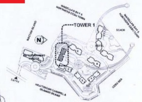
SITE DEVELOPMENT KEY PLAN