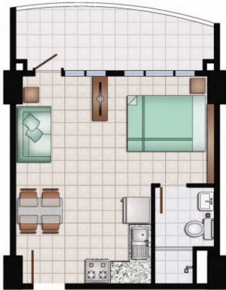
UNIT B UNITIZED