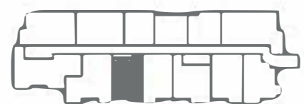
Fifth & Sixth Floor

The material provided herein is for general information purposes only and is not intended to depict as-built construction designs. The developer reserves the right in its sole discretion to make modifications or changes to the building design, floor plans, specifications, finishes, features, prices, materials, equipment (including appliances) and dimensions. Renderings and images are artistic concepts only. Dimensions are approximate and have been calculated from architectural plans. Actual final dimensions of construction may vary from those set out herein. As reverse, flipped and/or mirrored plans occur throughout the development please see architectural plans if this is material to your decision to purchase. Please see disclosure statement for specific offering details. E&OE.