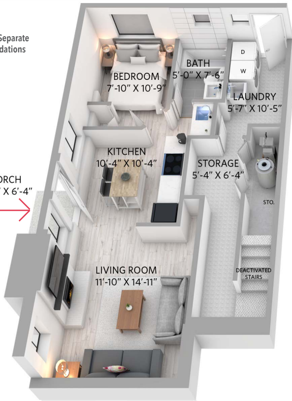
Main Floor - 762 sq.ft. Ceiling height - 8' 0"