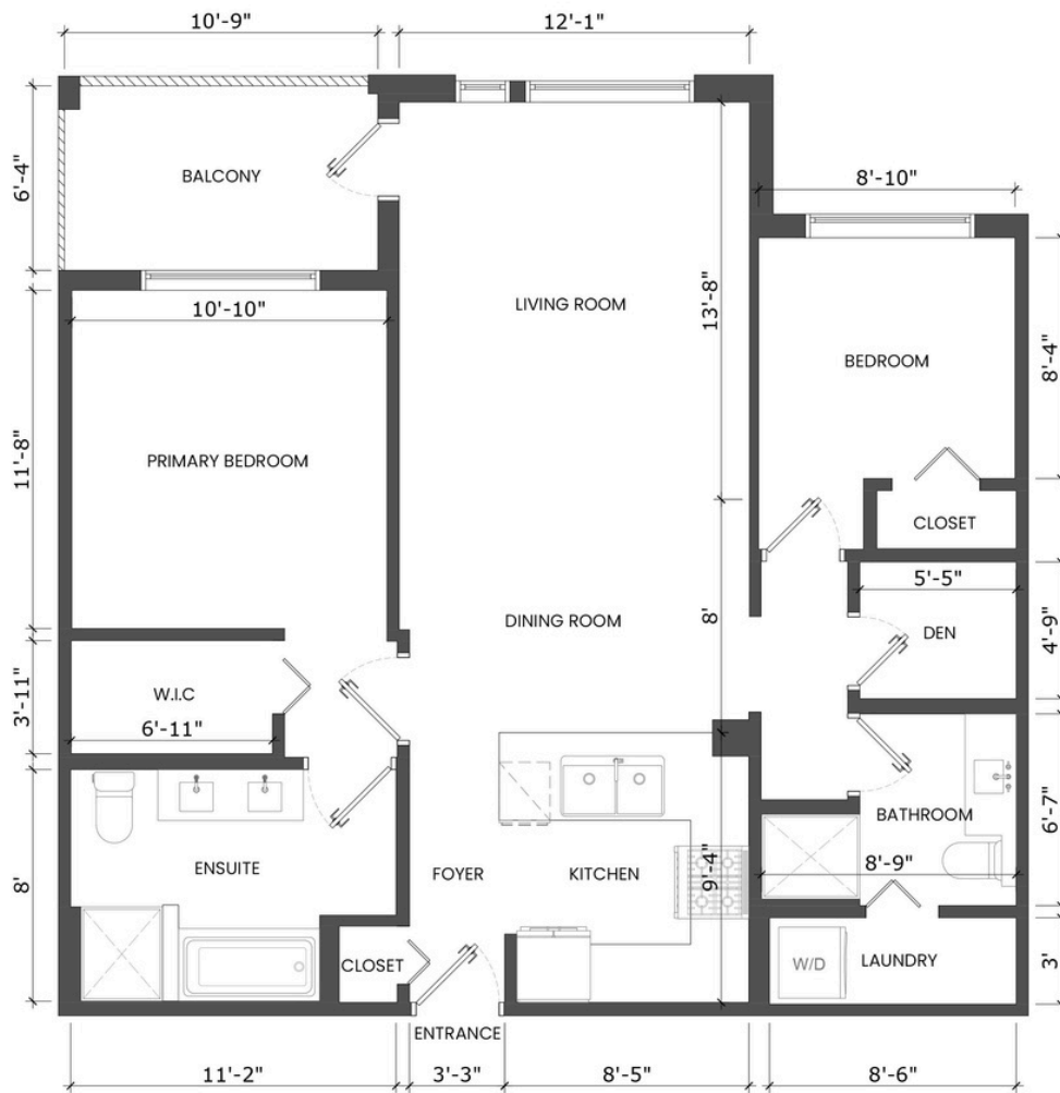
MAIN FLOOR PLAN Ceiling Height: 8'-0"

MAIN FLOOR TOTAL: 945 SQ.FT. BALCONY: 67 SQ. FT.