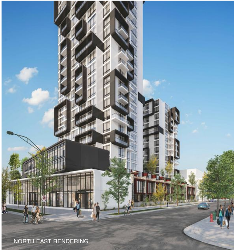
NORTH EAST RENDERING