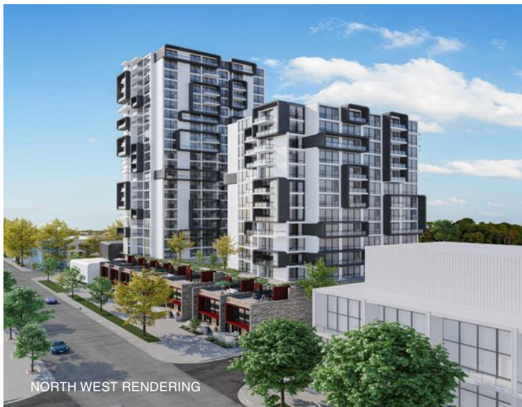
NORTH WEST RENDERING

The Langford Towers are multi-residential buildings designed to replace 5 single family dwellings on Jacklin Road and Bray Avenue in Langford, British Columbia.