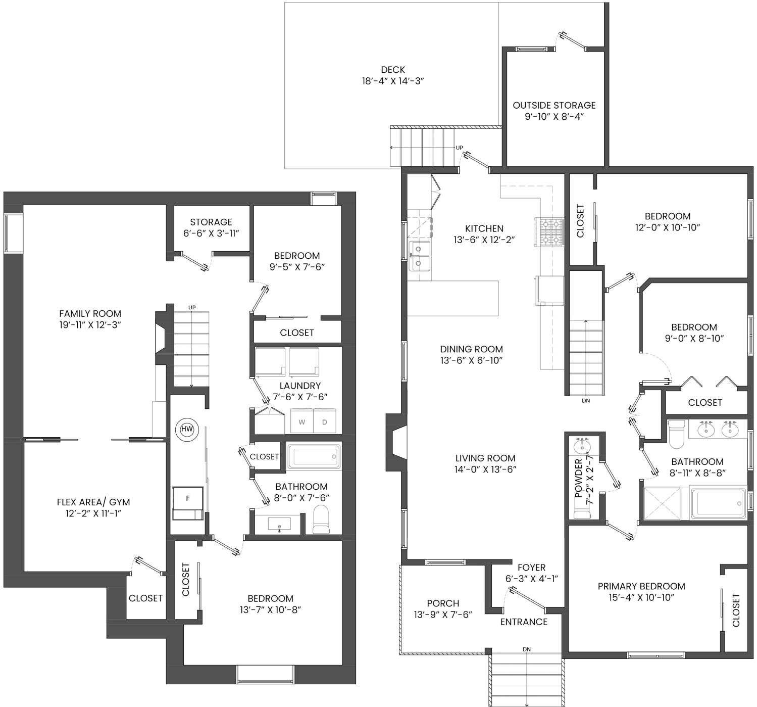
LOWER FLOOR PLAN Ceiling Height: 7'-0"

LOWER FLOOR TOTAL: 1,177 SQ.FT. DECK: 226 SQ. FT. MAIN FLOOR TOTAL: 1,187 SQ.FT. OUTSIDE STORAGE: 93 SQ. FT. TOTAL: 2,364 SQ.FT. PORCH: 75 SQ. FT.