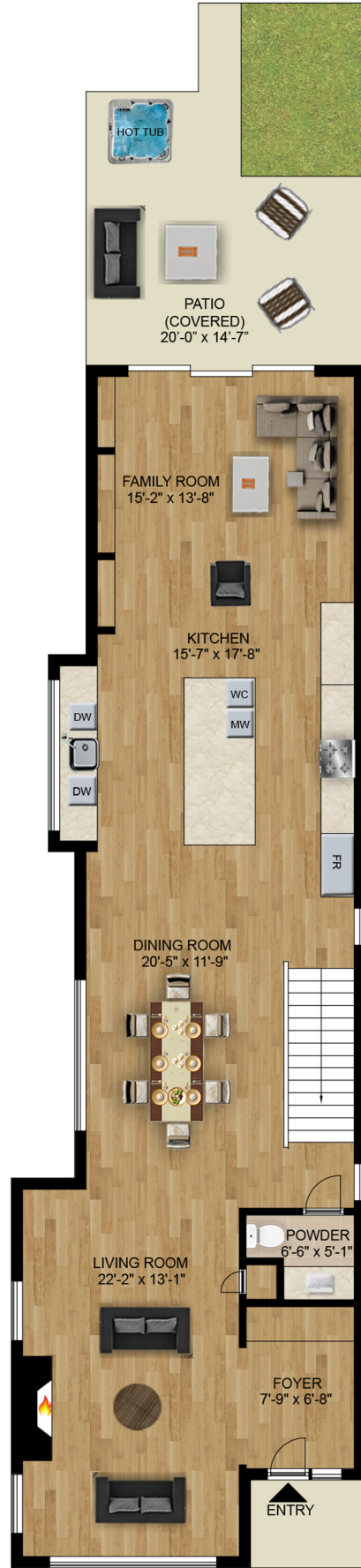
CEILING HEIGHT 9'-0" MAIN FLOOR 1,315 SQ FT