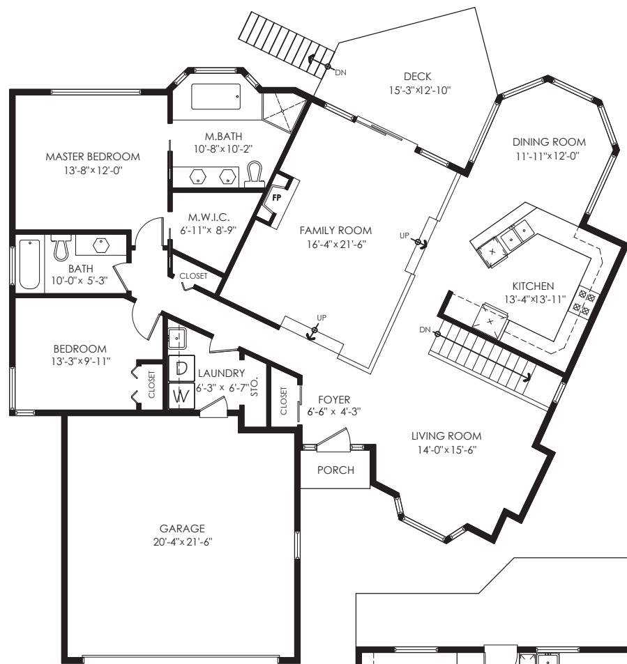
Main Floor Plan Floor Area: 1653 sq.ft. Ceiling Height: 8'