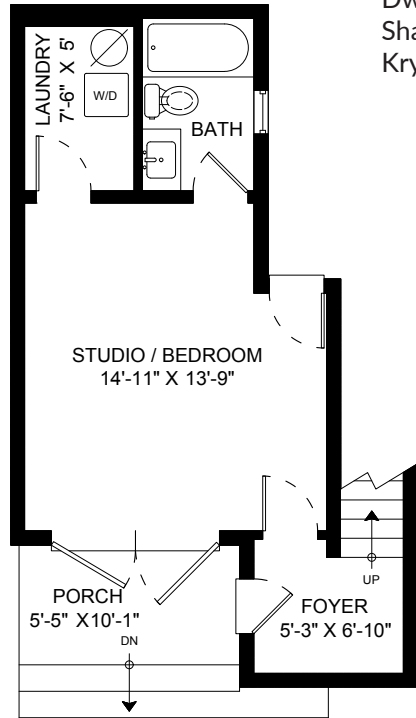
Main Floor: 380 Sq.Ft. Ceiling Height: 8'-9"