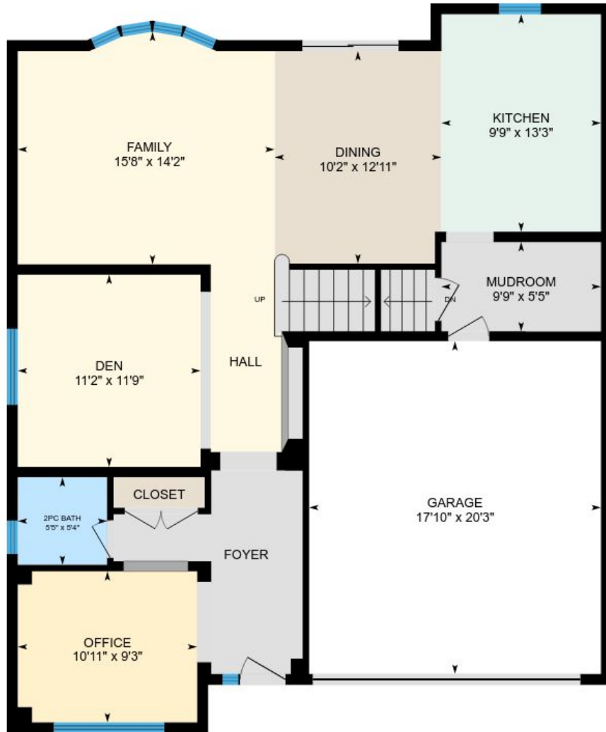
Main Floor Exterior Area 1139 sq ft

Total Exterior Area Above Grade 2503 sq ft (Main Building)