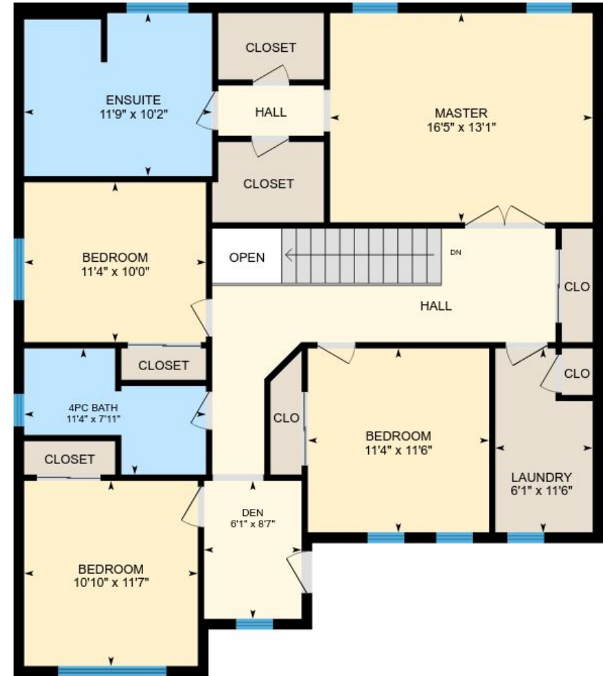
2nd Floor Exterior Area 1364 sq ft