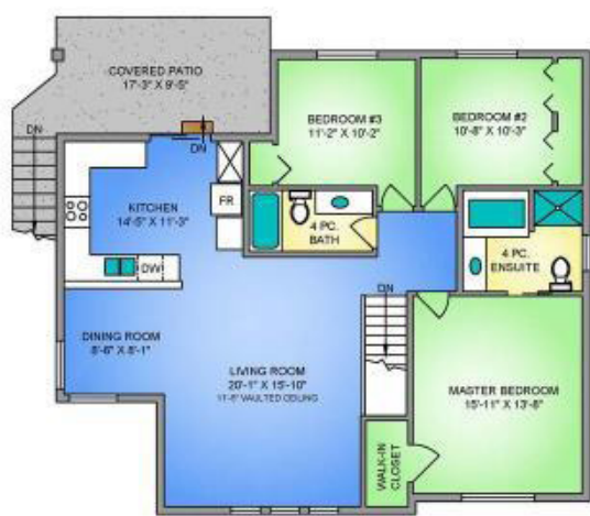
MAIN FLOOR 1403 SQ. FT.