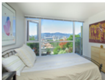
View from Master Bedroom