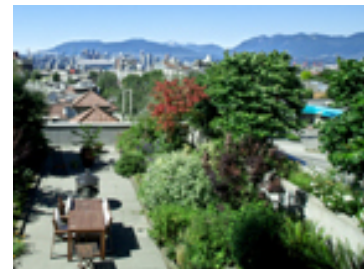
View from Balcony