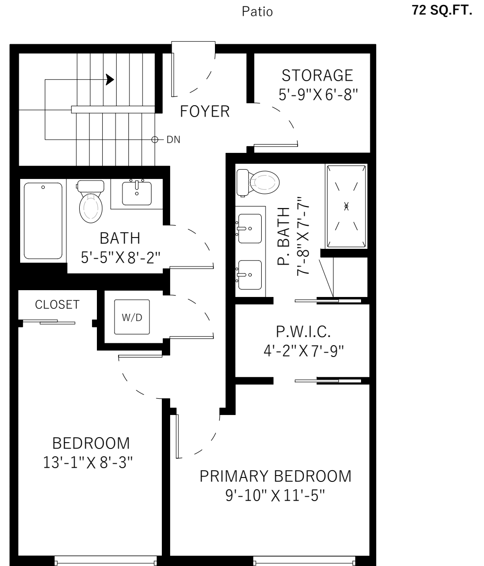
Upper Floor: 633 Sq.Ft. Ceiling Height: 8' / Max: 9'