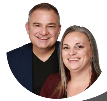
Visit for more details HomesInChilliwack.com