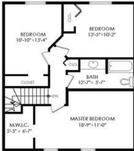
Upper Floor Plan Floor Area: 731 sq.ft.