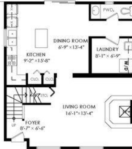
Main Floor Plan Floor Area: 726 sq.ft.