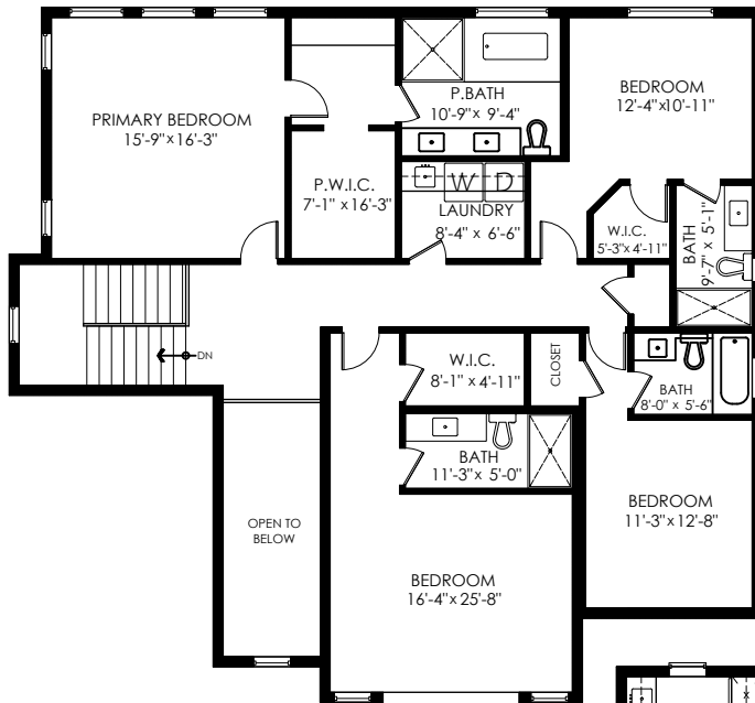
Upper Floor Plan Floor Area: 1838 sq.ft. Ceiling Height: 9'