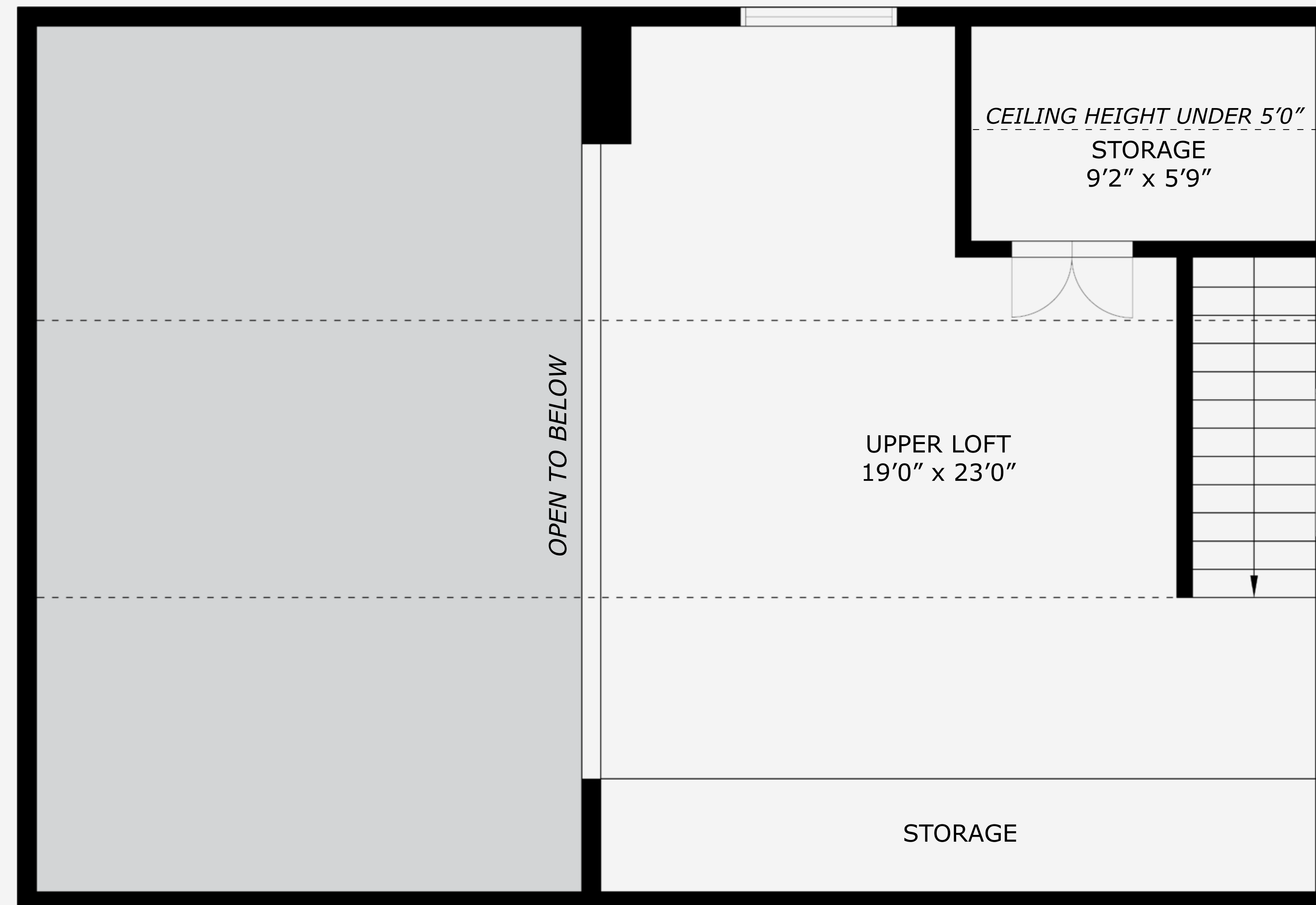
UPPER LEVEL (340 sq/f) VAULTED CEILING - 9'6"