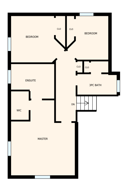
2nd floor Floor Area 800 sq. ft