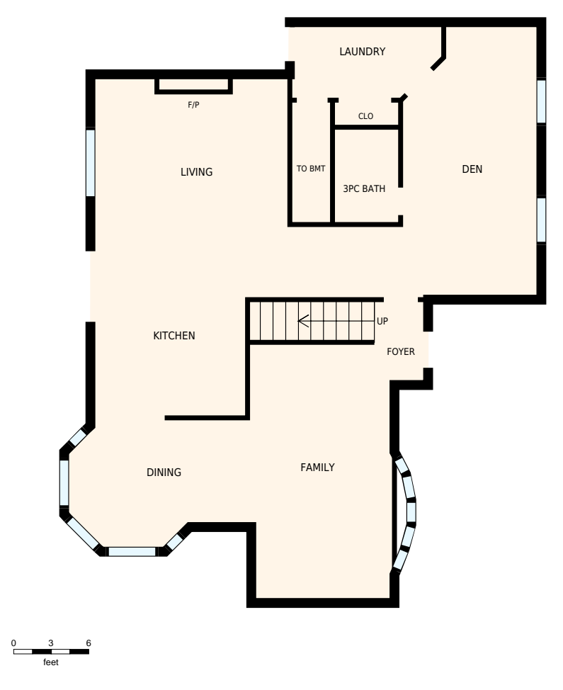
Main floor Floor Area 1370 sq. ft

Gross Floor Area Above Grade (GFA) 2170 sq. ft