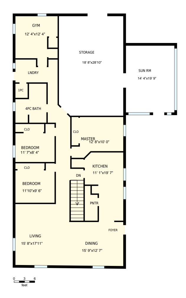
Main floor Exterior Area 1901 sq. ft.

Total Exterior Area Above Grade 3557 sq. ft.