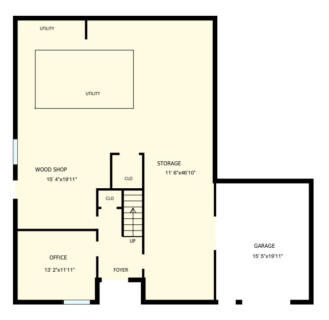
Lower floor Exterior Area 1657 sq. ft.