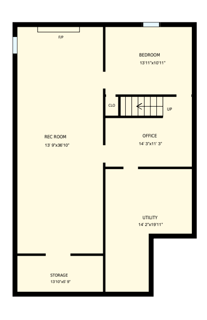
Main floor Exterior Area 1369 sq. ft