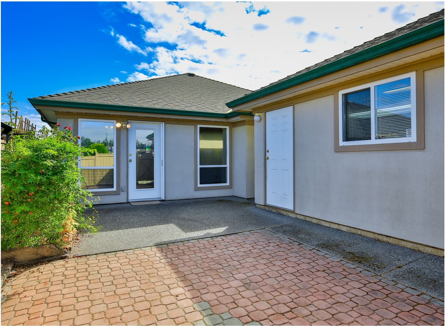
Patio area for entertaining and relaxing.