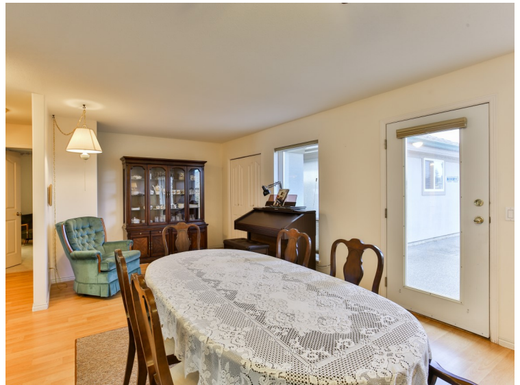
Spacious and bright living space with a cozy gas fireplace