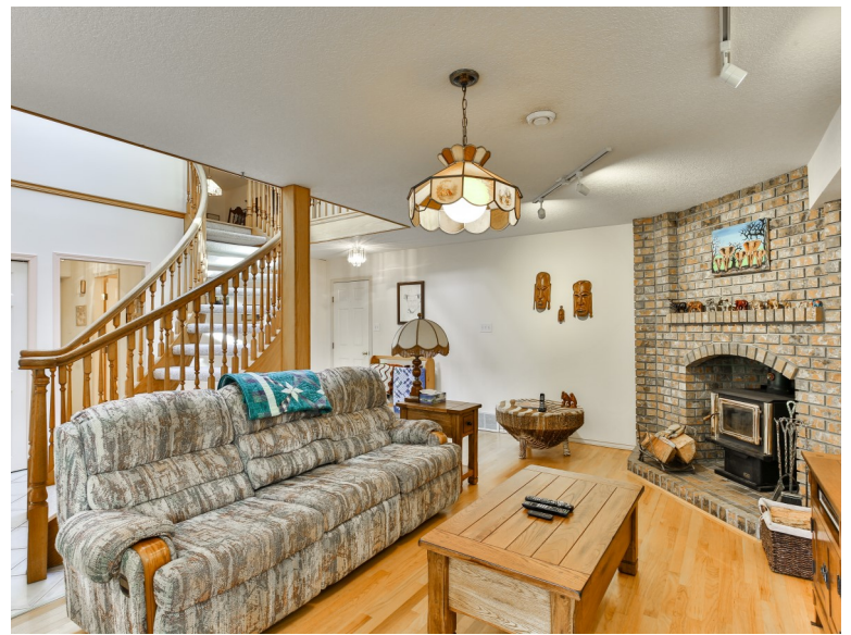
Large, bright family home on a private lot