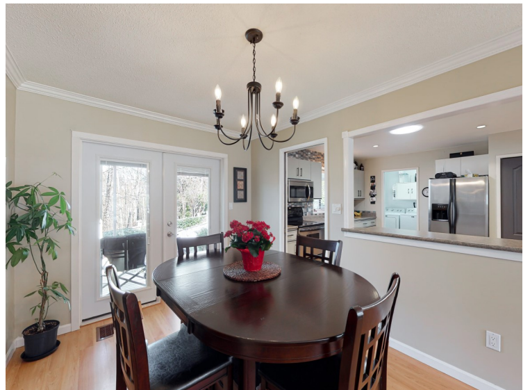
3 bed, 2 bath, 1358sqft level entry rancher