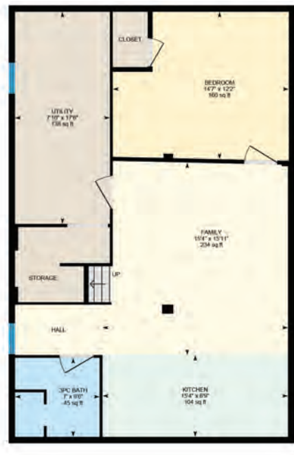
BASEMENT 854 SF