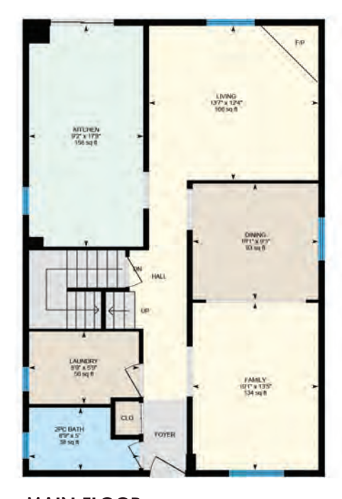
MAIN FLOOR 883 SF

Updated, 3+1 Bedroom, 4 Bath Home in a Quiet, Convenient Enclave in the Heart of Central Ajax Features Over 2,600 SF of Total Living Space with a New, Renovated Eat-In Kitchen, Quartz Counters & 4 Spa Inspired Baths Freshly Painted, with New Laminate Flooring, Baseboards, Designer Light Fixtures & Finished Basement with an In-Law/Nanny Suite Exceptional Locale! Steps To Shops, Parks, Schools, Library, Community Centre, Greenbelt, Bus, Groceries, GO Station, & 401