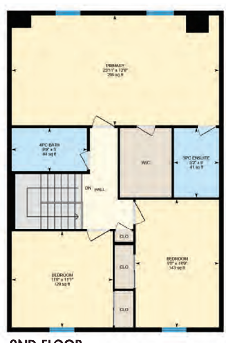
2ND FLOOR 915 SF