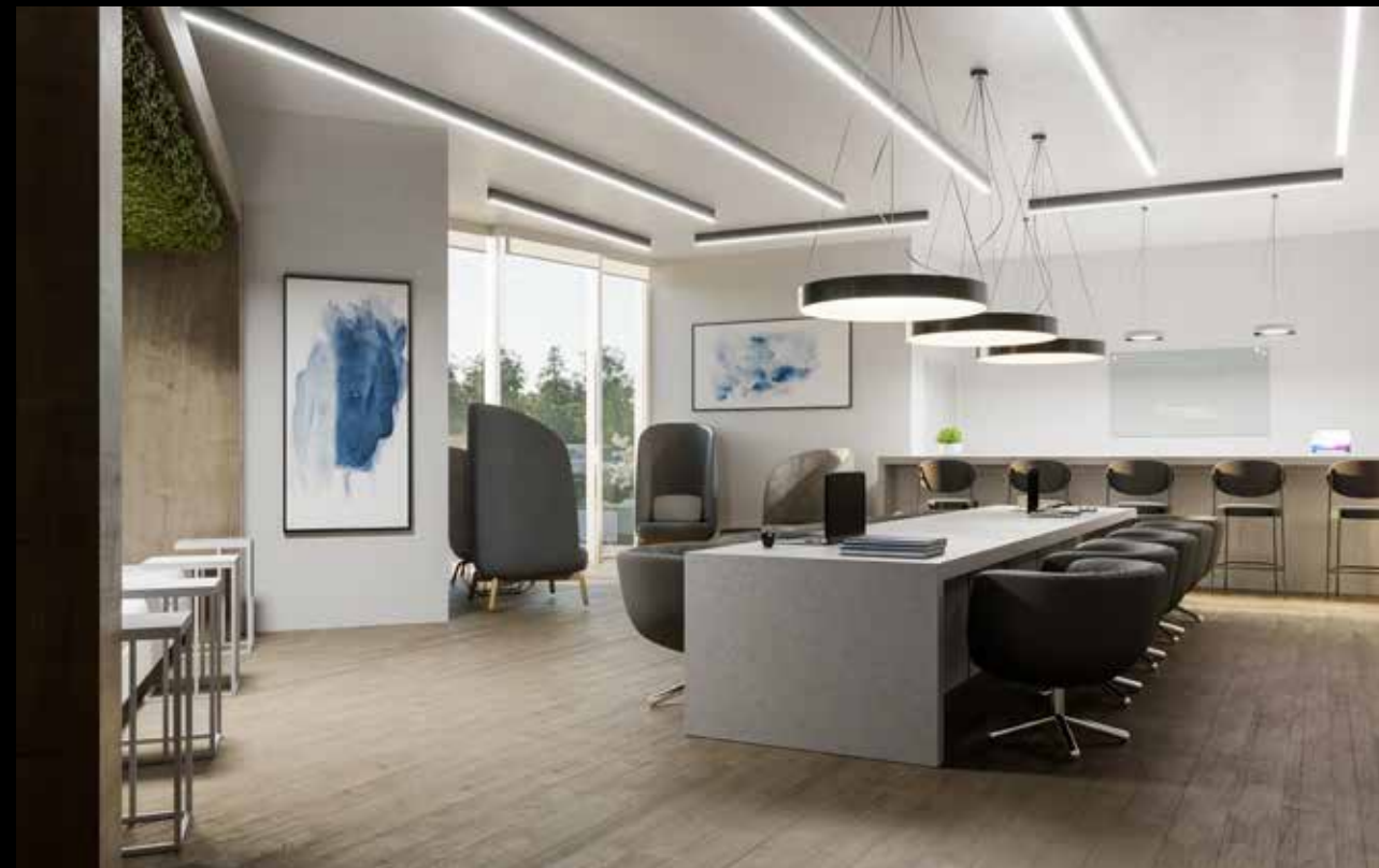
WORK STUDY LOUNGE