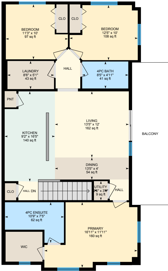
Main Floor Interior Area 1087.56 sq ft