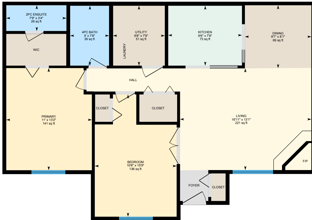
Main Floor Interior Area 918.68 sq ft